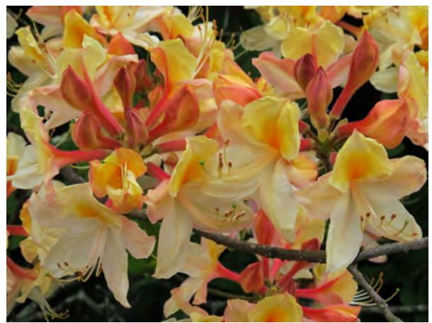
R. atlanticum \times 'Avocet' .