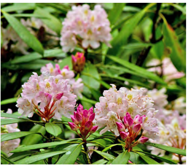
R. maximum at Cranberry Glades.

most of April was cold and often rainy and by the last week of April, virtually nothing shrub-wise was in bloom. Last year on the last week of April most early rhododendrons and many native azaleas were in prime condition. Since the MAC meeting, things have been in overdrive here in the garden. In just a little over two weeks, the blooming cycle has caught up and native azaleas are passing peak bloom and early lepidote rhododendrons are finished.