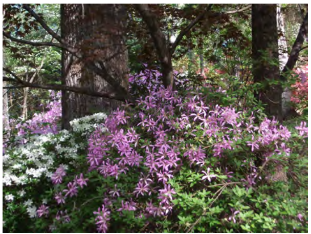
Koromo-shi-kibu in the Willis garden.

seedlings in one area. Of course, the plan is to save them all. Most of the Japanese maples in the yard survived the fluctuating warm, frigid winter weather. Two in pots did not. Two that had deer rubbings and looked dead are sprouting from the trunks.