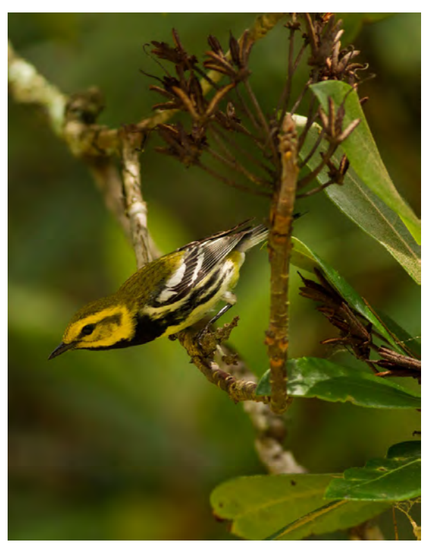
Black throated green warbler.

Black-throated blue and black-throated green warblers are just two neotropical warblers that call rhododendron thickets home. With regards to the MAC membership area, the Swainson's warbler is found in scattered southern West Virginia rhododendron thickets and then is not at home again until habitat offered by the Cypress Swamps