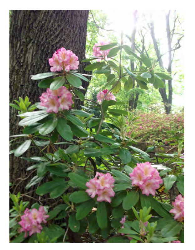
Rhododendrons in the Willis Garden.