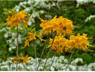
top along US Flame hybrid and dogwood.

Fetterbush bursts into full bloom a n d i n its protected location stays in bloom for weeks. Our favorite "spot in the wild" is on a mountain Route 33 on the