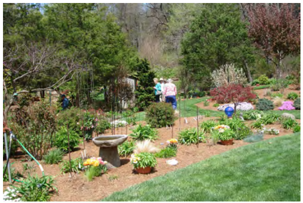
Heartflame garden.