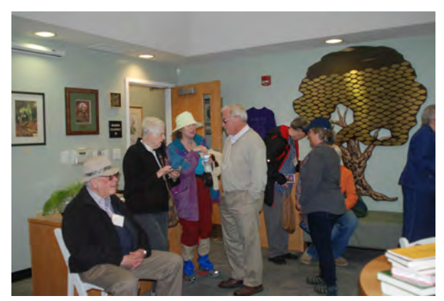
MAC members in the education building getting ready to tour.

The Arboretum has a very nice website with much information available.