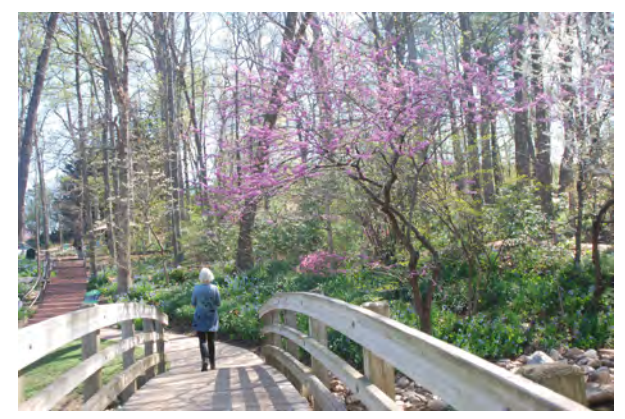
Bridge over the lake.

After lunch we left for our tour of Heartflame Gardens in Beldore, Virginia, near the Shenandoah National Park. The garden features daylilies which were not yet in bloom for our visit, but there were many different kinds of plants on 1.5 acres of cultivated land. Many different plants were in bloom and we did see a gigantic white oak tree there which appeared to be several hundred years old.