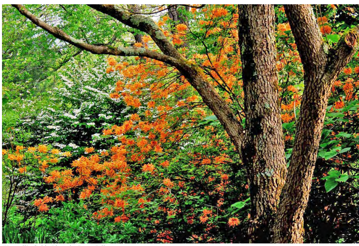
'Kennell's Gold.