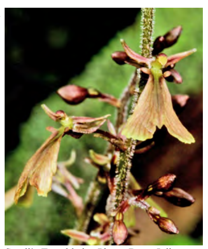
recent Spring Small's Twayblade.

e l e v a t i o n s through most of July when visiting our mountain counties. While this plant occurs throughout the state, it is seldom used ornamentally and seems to be scarcely available for purchase. As part of my talk presented at the recent Spring MAC meeting, I