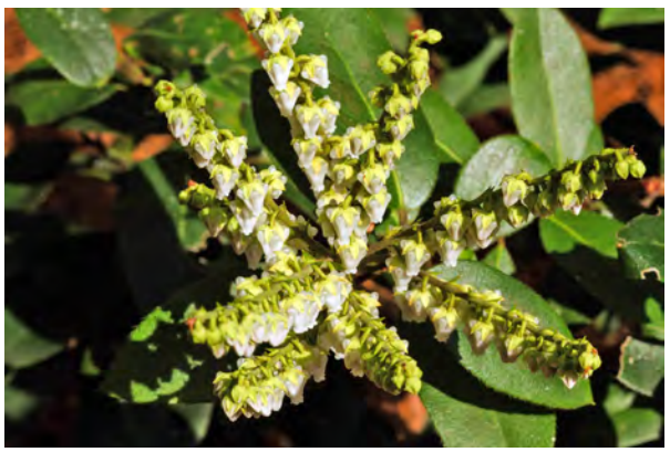
Pieris floribunda.

of Virginia's tidewater. Such is the issue of choosing suitable homesites!