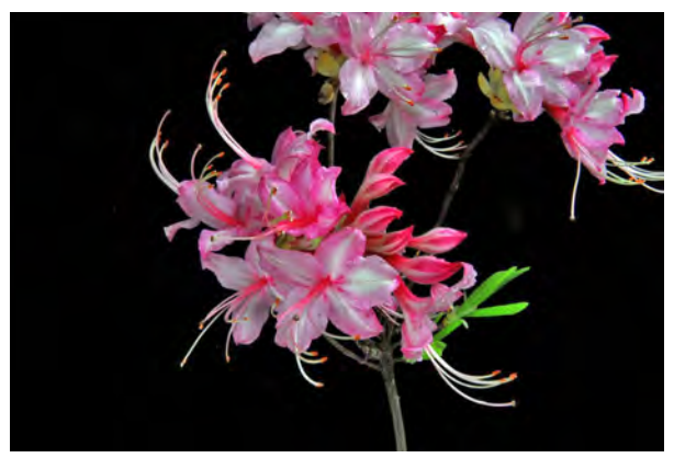
R. periclymenoides.