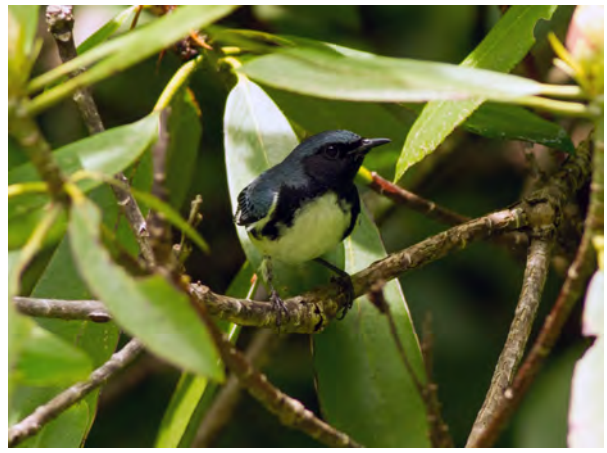
Black throated blue warbler.

exclusively growing beneath a canopy of R. maximum. All the sites in which I have encountered it in Pennsylvania, Virginia, and West Virginia find it growing beneath rhododendrons along mountain streams.