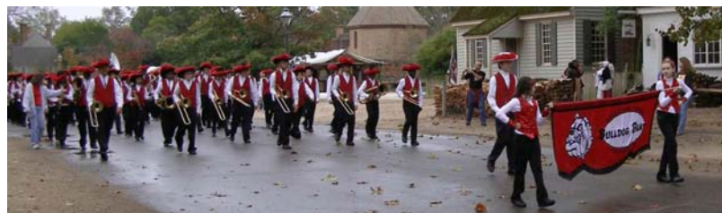
Wm & Mary Homecoming Parade.