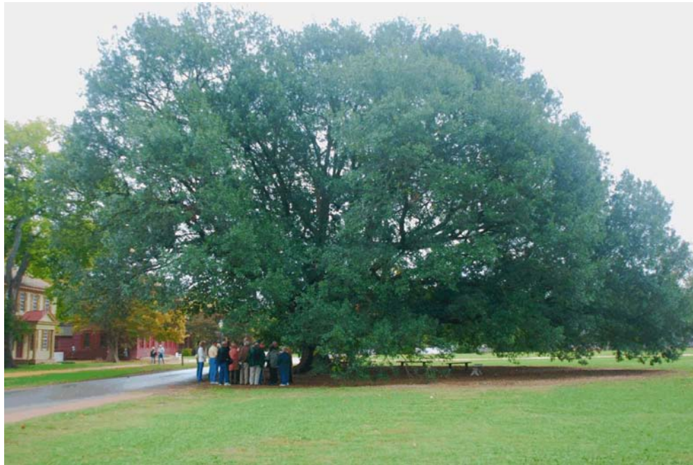
National Champion Tree: Compton Oak ( Quercus virginiana × Q. lyrata ) at Colonial Williamsburg with MAC members in a tour group beneath it.