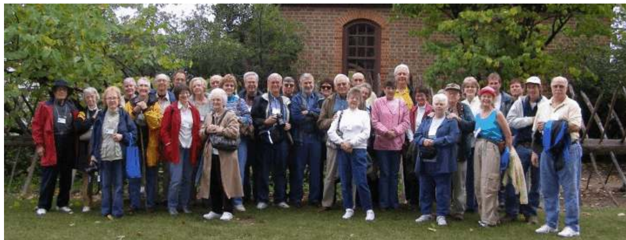
MAC members on garden tour in Colonial Williamsburg.

After the garden walk and before the rain started,