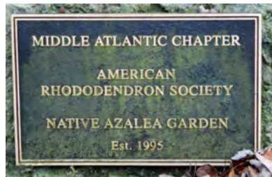
Sign for MAC Native Azalea Garden at JMU.