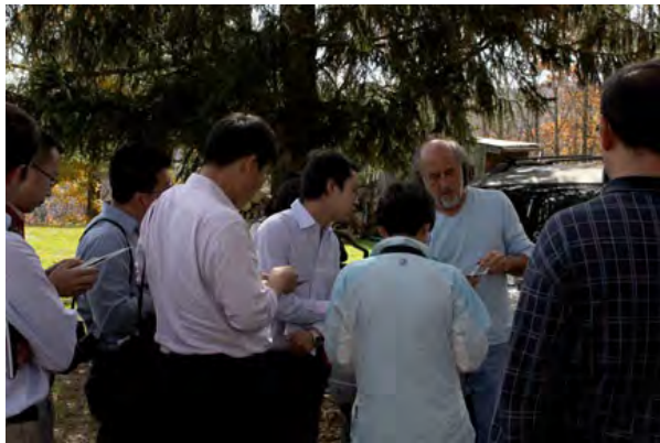
Chinese delegation at the Sunshine Farm tour.