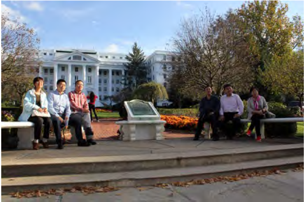
The Chinese delegation at the Greenbrier.