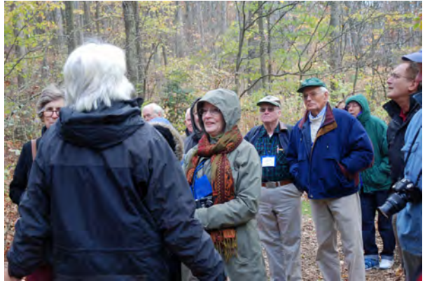
MAC touring Carrier Arboretum.