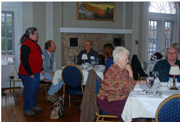
An elegant lunch at Mimslyn Inn.