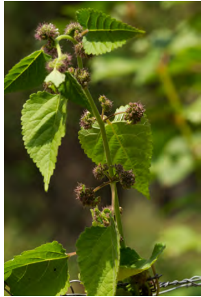
Mulberry weed, Fatoua villosa.

I did have the unfortunate experience of discovering a new invasive plant for West Virginia this fall while weeding landscape beds-- in my own garden ! I realized this in searching another weed for an inquiry at work and noticed that the weed that I had been pulling by the bucket fulls was