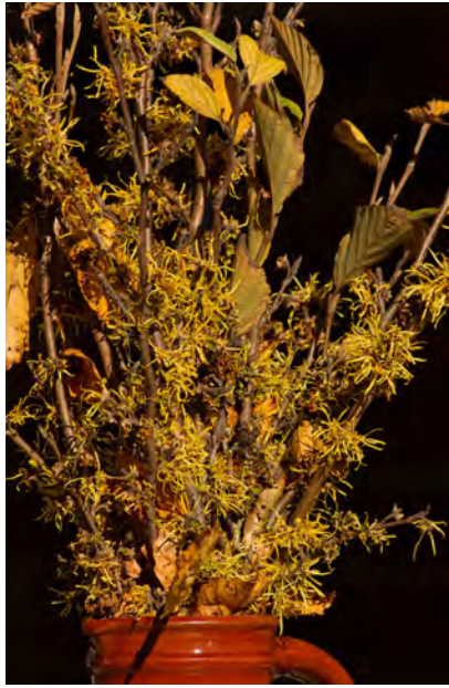
Witch hazel bouquet.

American Dogwood. For weeks this fall, migrating and resident birds visited these shrubs and trees in droves to feast on the bountiful seed crop. Deciduous holly growing in wild sites is as heavily fruited as I have known. While oriental witch-hazels are a month or more from blooming, the native witch-hazels in the