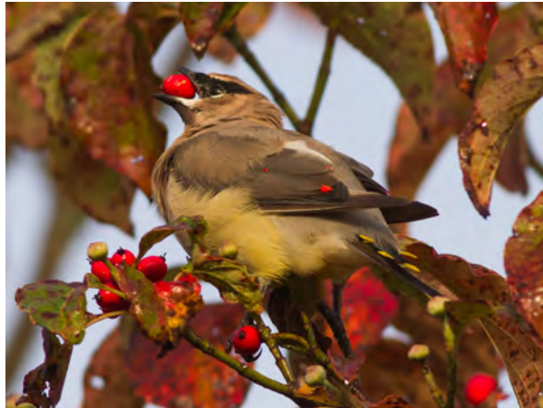
Cedar Waxwing with dogwood berry.

garden provided handsome bouquets on more than one occasion.