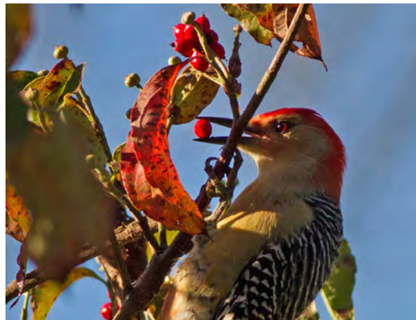
A woodpecker enjoying dogwood berries.