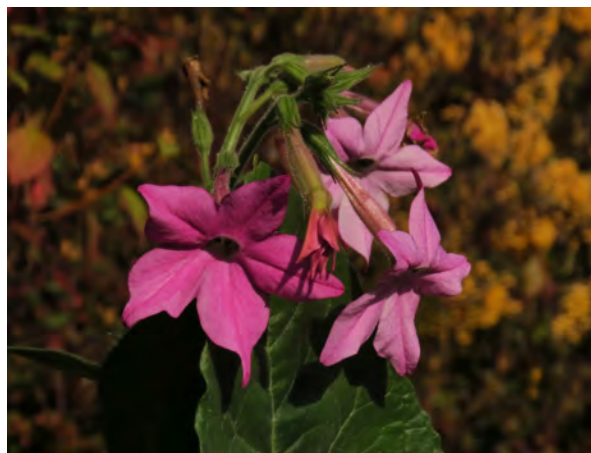
Flowering tobacco, Nicotiana .

seed was collected three years ago on a visit to the Connecticut Agricultural Experiment Station. The grounds at the station also have a nice selection of Ericaceous plants all nicely labeled.