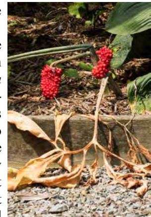
Green Dragon seed.

Another favorite companion plant is Green Dragon ( Arisaema dracontium ). The jack-in-the-pulpit like flowers bloom in late April into early May. The foliage then continues to grow upwards nearly 2 ½ feet tall. By late August attractive bright red clusters of seeds and fading foliage signal that the end of summer is near and the October 6 chapter meeting will soon convene.