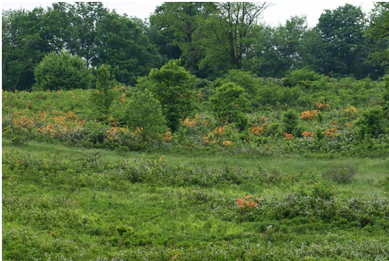
June 2, 2018, Flame Azalea hillside.

http://triblive.com/lifestyles/homegarden/13673818-74/retired-dentist-takes-great-pride-in-his-20-acre-woodland-garden