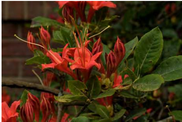
R. prunifolium .