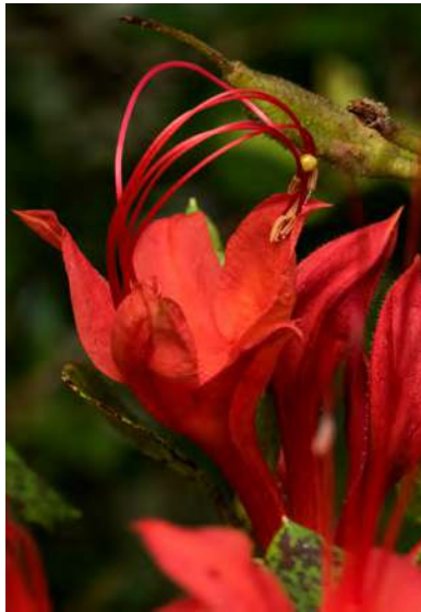
Closeup of R. prunifolium .

By mid-July our Plumleaf Azaleas ( R. prunifolium ) reached its full display. The season for this plant seems to be creeping from late July toward the middle of the month now. A nice salmon colored hybrid from the ARS seed exchange also was a nice companion to the scarlet of the