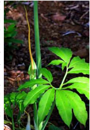
Green Dragon.

Plumleaf Azaleas. The hummingbirds love to visit these plants. One “weed” that we have throughout our landscape beds is Cardinal Flower ( Lobelia cardinalis ). These native lobelias self-sow profusely. Plants can grow, are given away to garden groups and pulled and discarded. Butterflies, hummingbirds and various other insects make for interesting walks through the garden. Great Blue Lobelia ( L. siphilitica ) and Downy Lobelia ( L. puberula ) also are nice companion plants and bloom through the summer months.