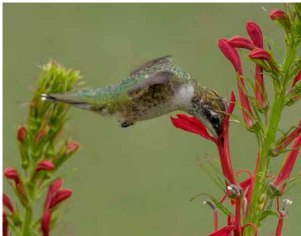
Hummingbird on Lobelia cardinalis . Photo Doug Jolley.

Plumleaf Azaleas. The hummingbirds love to visit these plants. One “weed” that we have throughout our landscape beds is Cardinal Flower ( Lobelia cardinalis ). These native lobelias self-sow profusely. Plants can grow, are given away to garden groups and pulled and discarded. Butterflies, hummingbirds and various other insects make for interesting walks through the garden. Great Blue Lobelia ( L. siphilitica ) and Downy Lobelia ( L. puberula ) also are nice companion plants and bloom through the summer months.