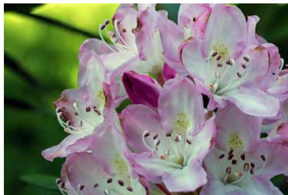
'Red Max' seedling.

Speaking of falling rain, our entire summer has been rainy here in central West Virginia. Despite this or because of this, our rhodos, azaleas and most everything in the garden has bloomed and grown terrifically. A 'Red Max' seedling from a chapter meeting is now 3 feet tall and 5 or so feet wide. The buds are dark pink and the open flowers retain dark pink margins. Add a green blotch to the upper petal