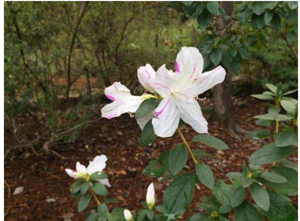
Azalea 'Festive'.