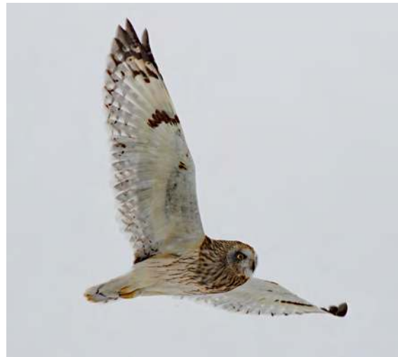
Short Eared Owl.