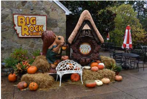
Rock City.