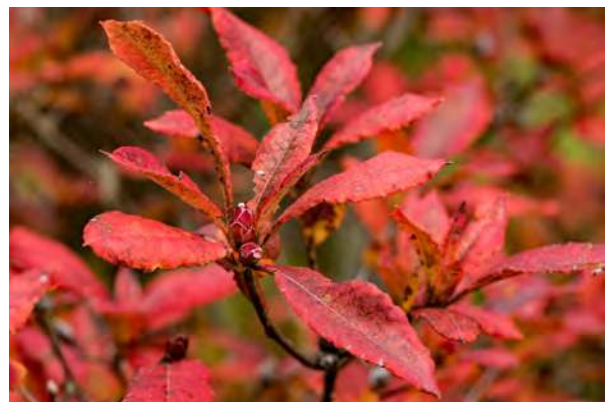
Rhododendron periclymenoides.