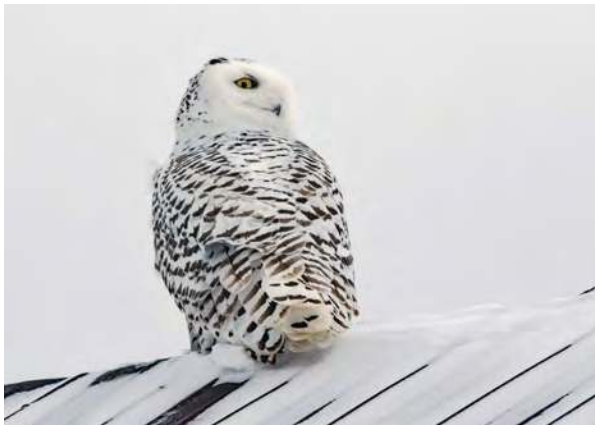
Snowy Owl from a cold birding trip to Amherst Island and Algonquin Park in Canada.