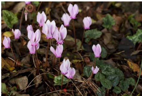
Cyclamen.

a flower or two per bud in lieu of a full truss, R. 'Mist Maiden' and R. 'Landmark' bloomed nearly to perfection. By mid-October, both were in full springtime regalia and quite enjoyable. Both