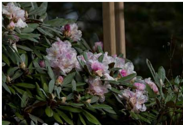
R. 'Mist Maiden'.