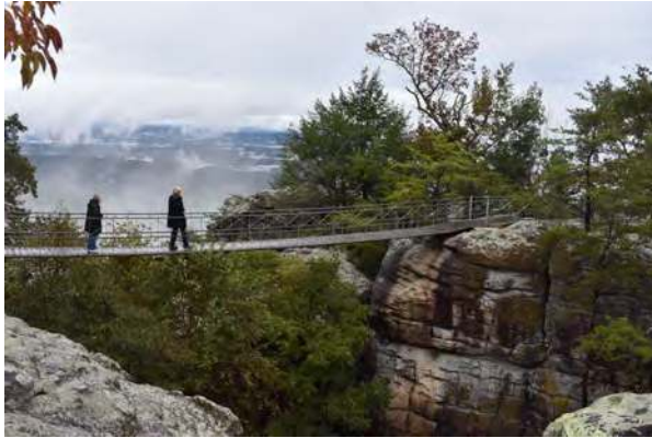
Rock City suspension bridge to Lookout.