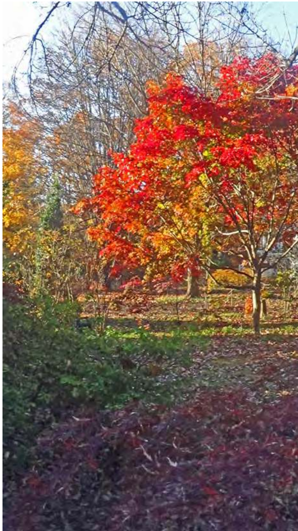
Colorful maples.