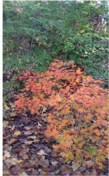
Japanese maple.