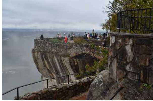
The cliff at Lookout Point.