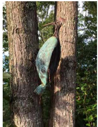
Pileated woodpecker sculpture in Jones garden.