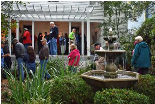
The Drucker garden.

The next stop was the woodland garden of Jimmy Wooten and his late wife, Ilona, which features a large collection of decades-old and now often rare rhododendron hybrids that have “stood the test of