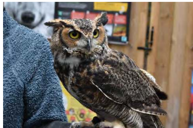
Owl at Reflection Riding Arboretum.