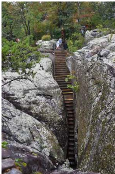
Rock City "Fat Man's Squeeze".