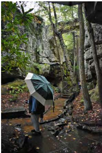
Rock City trails.