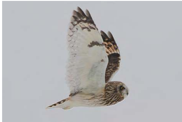
Short Eared Owl from Doug's birding trip.