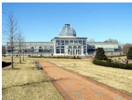
The new conservatory at Lewis Ginter Botanical Garden.

garden with “tapestry steps” made by using a variety of materials that they had on hand. They also had no master plan and owe their success to their combined talents which include Pat’s knowledge of plants and Hugh’s design and building skills. At the Lewis Ginter Botanical Garden we will be served a tasty box lunch in a special tent reserved just for our group. There will be plenty of time to explore the forty-some acres of spectacular gardens and check out the “Walk on the Wild Side” where