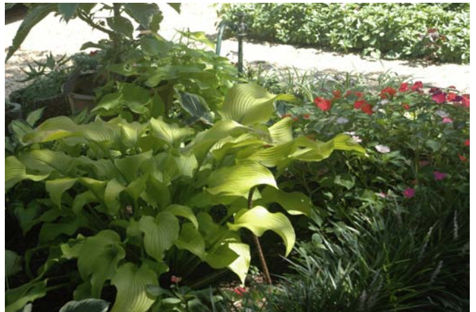
The Greene garden.