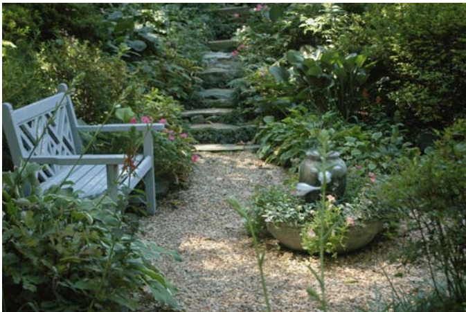
A quiet spot in the Greene garden.