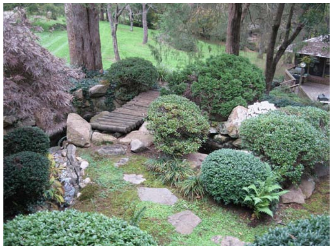
Junco Liesfeld's garden.