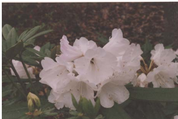
R. metternichii × R. hyperythrum .

Now for a followup on the cuttings I made last fall. I stuck 27 cuttings and 20 have good roots, and the foliage looks good. Two have roots but their foliage looks terrible so I’ll wait to see if they sprout new growth. Five have no roots but the foliage looks good on 4 cuttings so I will leave them in their plastic bags and give them a bit more time. The last one I threw out. Three of the cuttings that rooted well are