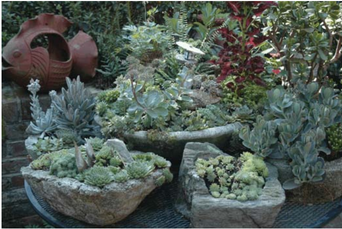
Rosalie Nachman's garden.