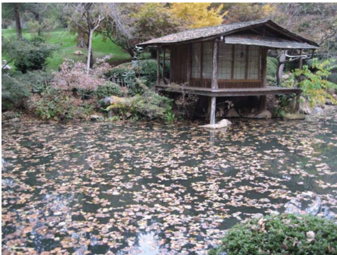
Junco Liesfeld's garden.