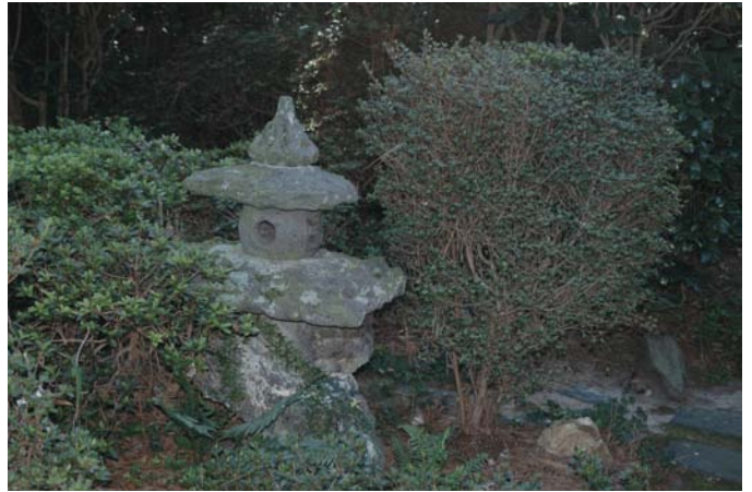
Rosalie Nachman's garden.