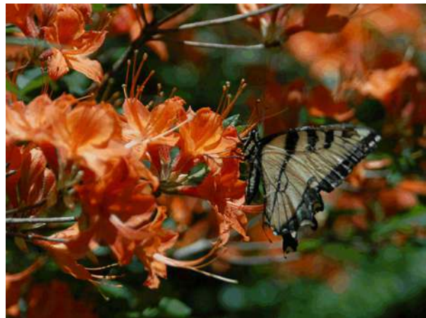
R. calendulaceum on Hooper Bald.

A real advantage to this project on Hooper Bald is the relatively easy access. Using any of the several motels in Robbinsville, NC as our base, only a short drive is needed to get to the scenic Cherohala Skyway. From the Skyway entrance to the parking area at Hooper Bald is not far, a little less than 12 miles. After parking, we have just a short walk of about a quarter mile along a gravel path to get from the parking area to the Bald. (There are even restroom facilities - not typical conditions for most wilderness areas.)