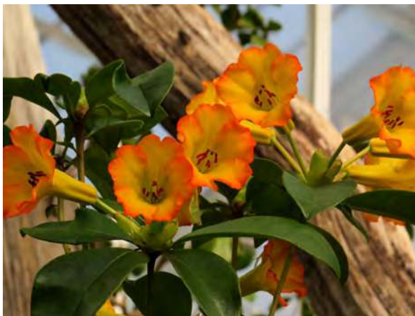
A vireya at Planting Fields.