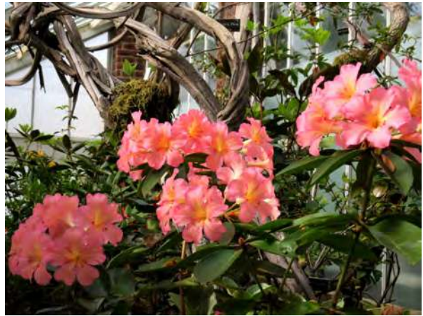
Vireyas in the Planting Fields greenhouse from the New York Chapter ARS project.