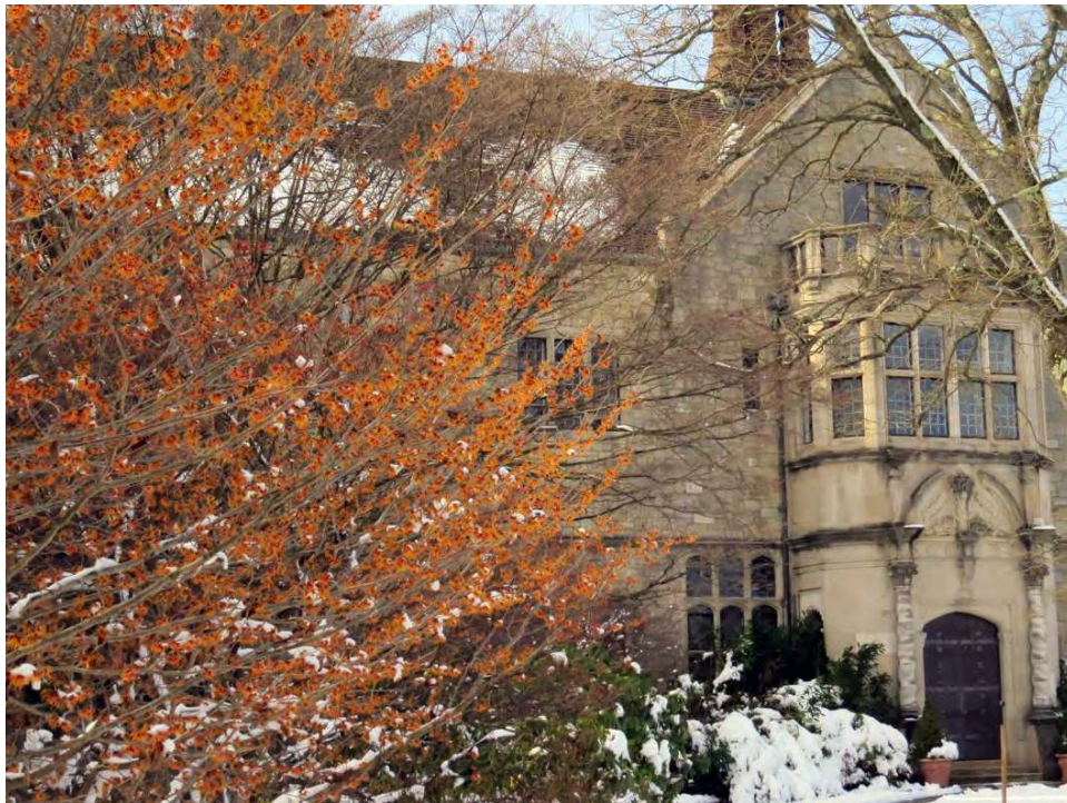
Witch hazel blooming at Planting Fields.