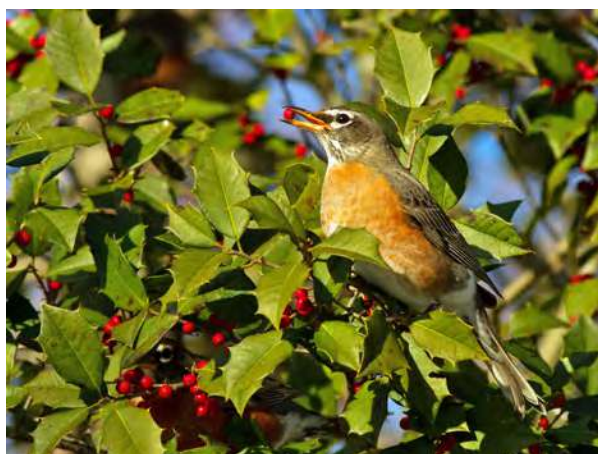
Robin with holly berry.

For our garden, a variety of Viburnum species makes for great companion planting for our rhododendrons and azaleas. In addition to a variety of flowers, fragrance and foliage, they are a magnet for birds in that they provide shelter for nesting and a bounty of berries which are consumed at various times through the year. In one season, in preparing for a Master Gardener talk, I photographed twenty-one species of birds that visited our viburnums. One other great bird plant is of course our native dogwood, Cornus florida . Its flowers and fall foliage are nice and again, the birds appreciate the