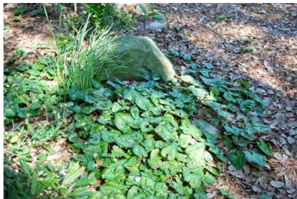
Cyclamen hederifolium .

Two Cyclamen which I recommend are Cyclamen hederifolium and C. coum , both hardy in Zone 8 to Zone 4. Cyclamen hederifolium blooms before its foliage emerges starting sometime in August with a few flowers, reaching its peak in October and declining as its foliage begins to appear in late October. The five swept-back petals appear on 3 inch stems (scapes) and can range from deep pink to pale pink and white on different forms. But it is the winter foliage that is the real star for the winter garden. Each tuber produces its own distinct foliage with different patterns, colors, and shapes