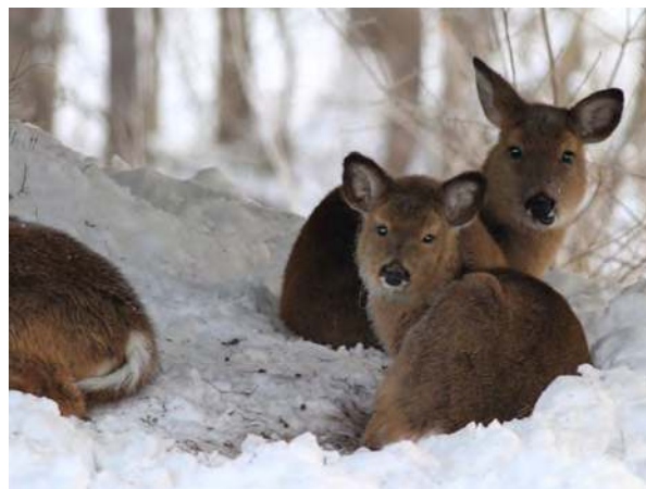
Deer in the snow.