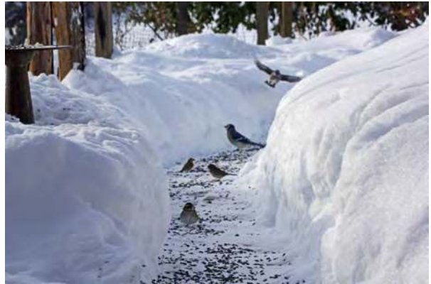
Bird feeding pathway in the snow.