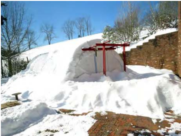
Plastic house in snow.