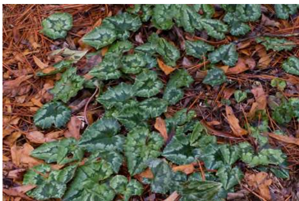
Cyclamen.