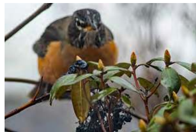
Robin with Rhododendron 'Brandywine' .

Robins descend upon hollies, viburnums and crab apple trees seeking sustenance during harsh late winter weather spells. This early February was no different except for the continual waves of birds covering trees, shrubs, lawn and pasture. Even seasoned birders do not get too keyed up about robins, but this event was