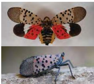
of Lanternfly.

State Departments of Agriculture are asking for sighting information so that immediate steps to combat this invader may be taken.