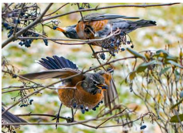
Robins busy eating berries.

One of our favorite companion shrubs include a number of witch-hazel cultivars. Some signal their coming into bloom by emitting an intense fragrance while others brighten drab area of the landscape. The winter which was just described effectively delayed January blooming and now in early February, the garden is coming alive with yellows, salmons and reds signaling witch-hazel season. The cultivar 'Cyrille' while not yet at peak anthesis is bright even on a dreary, rainy day.