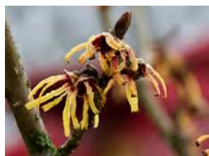
Hamamelis 'Cyrille' .

One of our favorite companion shrubs include a number of witch-hazel cultivars. Some signal their coming into bloom by emitting an intense fragrance while others brighten drab area of the landscape. The winter which was just described effectively delayed January blooming and now in early February, the garden is coming alive with yellows, salmons and reds signaling witch-hazel season. The cultivar 'Cyrille' while not yet at peak anthesis is bright even on a dreary, rainy day.