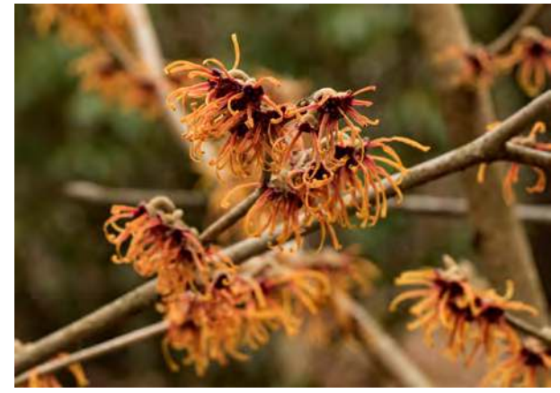
Witchhazel Magic Fire.

enthusiasts, this was a great way to enjoy a great December day.