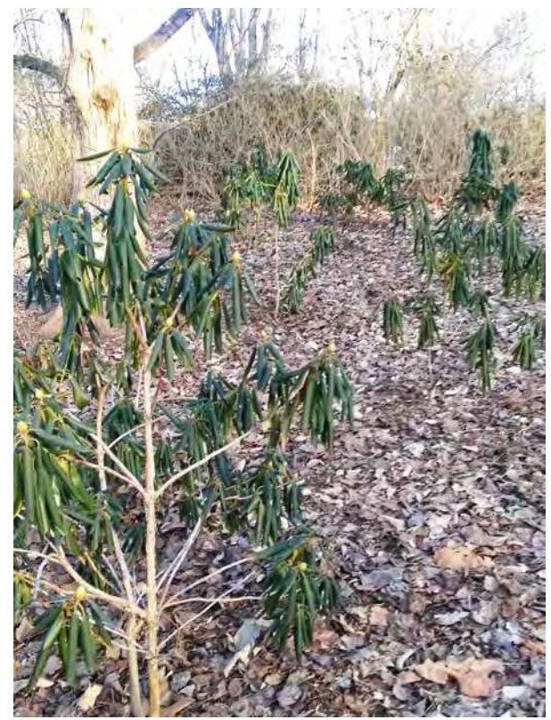
A cold, well-budded Rhododendron in the Willis garden.