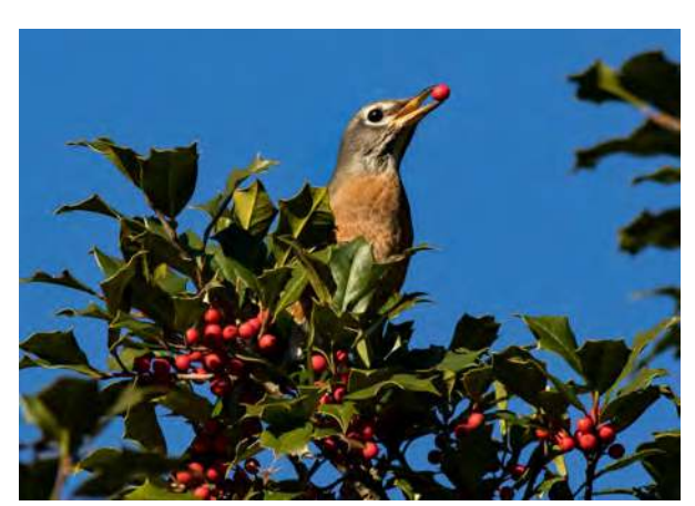
Robin in American holly.

our deciduous azaleas. Nothing is guaranteed, as we all know, when it comes to what deer will and will not eat. For whatever reason though, this plant seems immune to browsing and is floriferous year after year with no special care. Rhododendrons in winter are still interesting given the myriad of shapes and textures of buds and leaves.