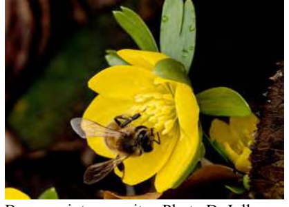
and the flowers Bee on winter aconite.

temperature swing. Last week we experienced single digit nights. A couple days of moderate temperatures,