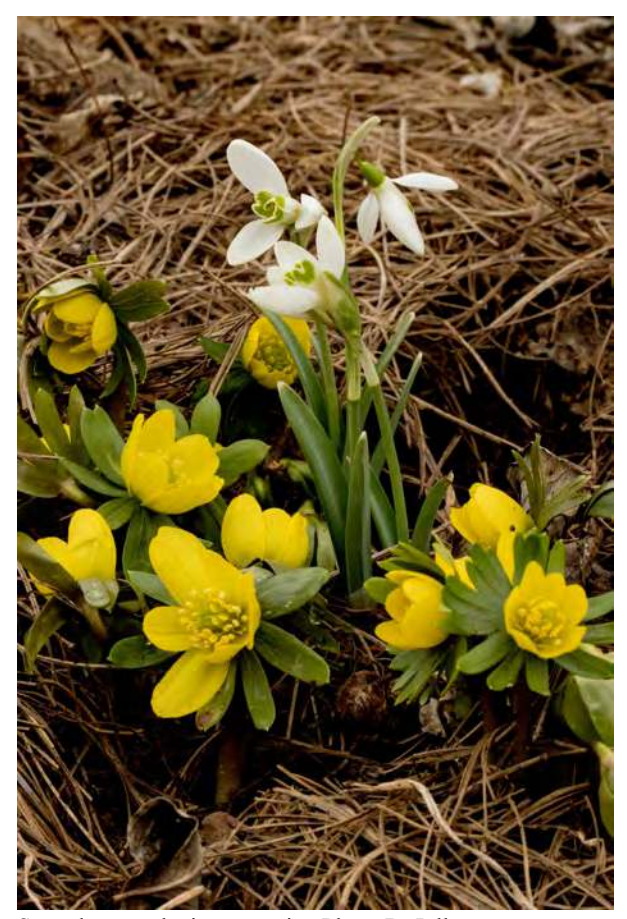
Snowdrops and winter aconite.

Included with this writing are a couple photographs of bud-laden rhododendrons. Our coldest couple of nights were in the single digits; not enough to harm our plants. One of our most consistently heavily bud-laden plants is a Rhododendron prunifolium . We obtained this plant from the McDonalds more than 30 years ago. Aside from the source, one unique feature of this plant is that it resides outside our deer fence. It is at the edge of a group of mature white pine trees and happens to be a favorite bedding spot for a handful of deer through the winter months. We are often asked if deer eat deciduous azaleas ,and we often point to this plant as an example that deer do not "prefer"