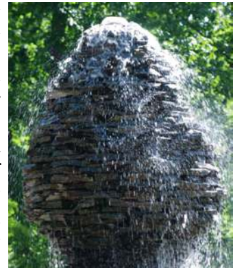
Gillenwater Garden and with a fountain in it.

Saturday was a wonderful day of garden tours. Jay Gillenwater arranged for us to see some very special gardens: Fox Haven Garden, the One of Jay Gillenwater's cairns nursery where we had