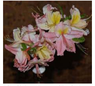
'Cecile' × 'Sweet Charity'