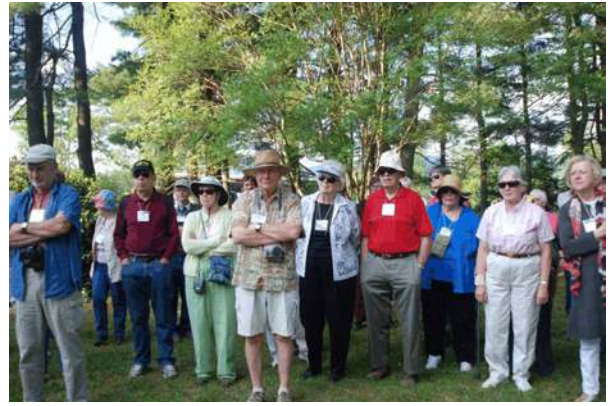
MAC members at Fox Haven Garden.