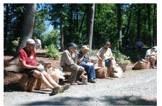
Lunch in the Gillenwater Garden.