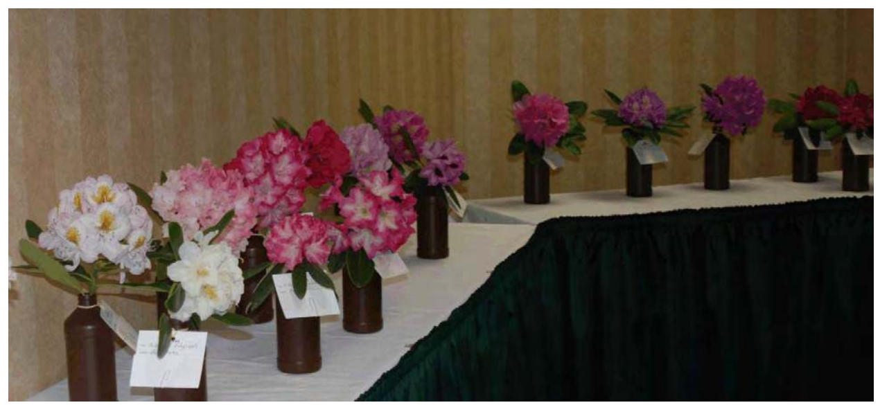
Some of the Flower Show entries.

On behalf of the US Forest Service's Cheoah Ranger District, I am pleased to present this certificate to the Mid-Atlantic Chapter of the American Rhododendron Society in recognition of your volunteer service on Hooper Bald. Hooper Bald is an important historic resource to the US Forest Service and the local community. The work that your organization id doing to remove encroaching trees and shrubs is ensuring that this area remains an open meadow bald. Furthermore, removing competing vegetation from around the many Flame Azaleas on Hooper Bald has provided an exceptional flowering display for Rhododendron enthusiasts and other