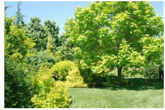
The yellow garden at Whilton.