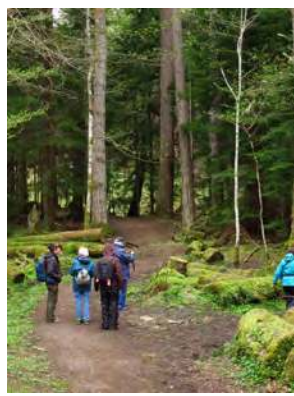
Reelig Glen in Scotland.