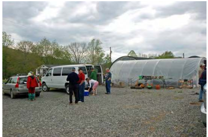
Visiting North Hills Nursery, Specialty Succulents.