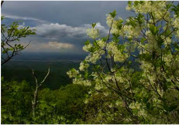
Fringe tree at Wintergreen.