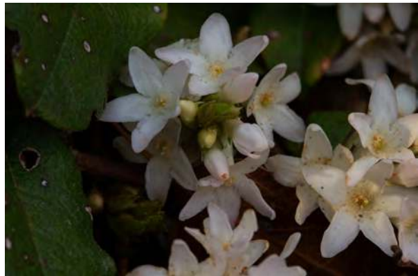
Trailing arbutus.

severely frozen in early April. Those early rhododendrons had nice seasons actually, given their early bloom dates. Often they are ruined just shortly after opening. Since early April, this has been one of the best spring seasons in memory.