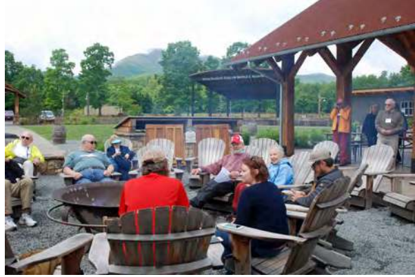
Sitting around the fire pit at Devil's Backbone Brewpub.