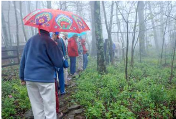
Touring Wintergreen Nature Foundation wildflower garden.