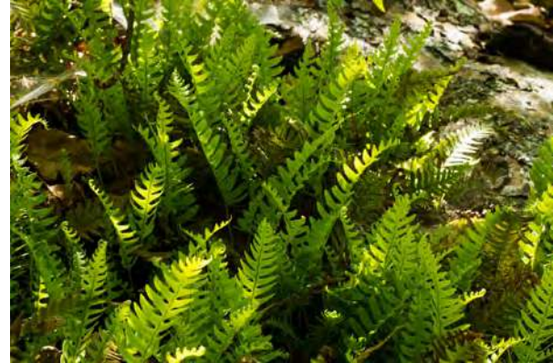
Rock polypody fern.