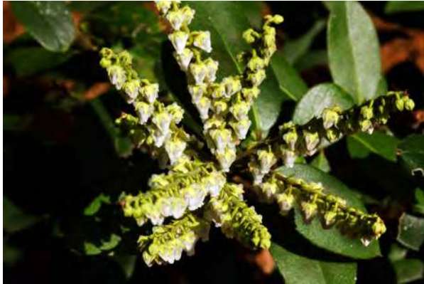
Pieris floribunda.

I was able to get out to remake acquaintances with Trailing Arbutus. After a few years of missing its fragrant flowers, I made a point to keep track of a nice patch and one of my visits was perfectly timed. This is one wild Erica that is more than reluctant to transplant so a home visit is a must. After a handful of unsuccessful attempts with our