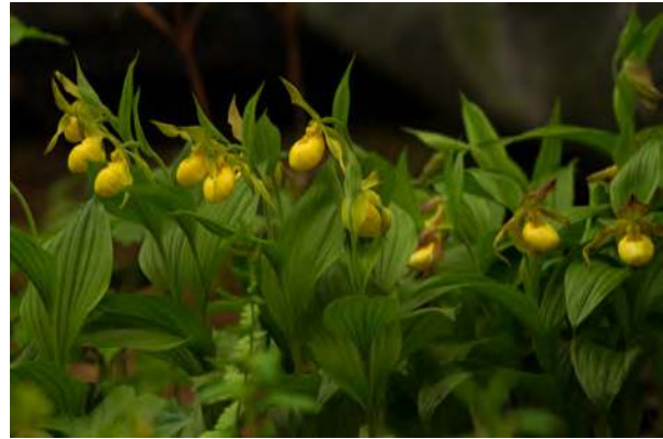
Yellow lady slippers.

Davetta's and my efforts at growing native azaleas are drastically diminishing. We are converting growing beds to blueberries. Strawberries serve as their companions. Also, we spent the fall and winter drastically cutting down shrubs, trees, limbing up trees and having continual hot dog roasts from the resulting bonfires. We are restoring views out from the garden and letting light in for the remaining plants. Five years without deer (from a successful fence) resulted in a vegetative