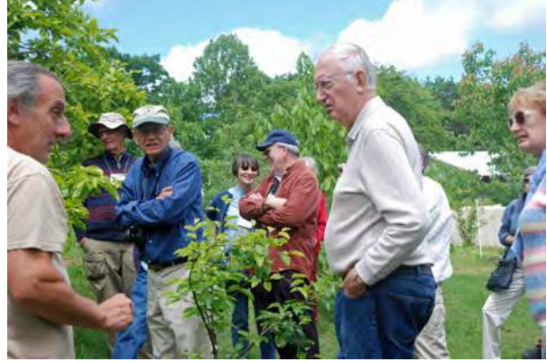
MAC members at Edible Landscaping Nursery.