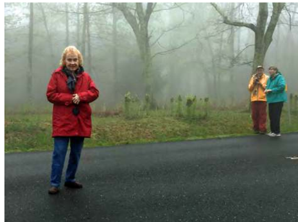
Color in the fog by the interrupted fern.