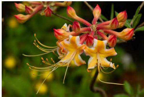
'Millie Mac'.

native wild Pieris , one now is luxuriant in the shade house. It bloomed from early March through mid-April. Since pollinators are largely excluded from the plants within this structure, flowers of azaleas, lady slippers and this Pieris ( Pieris floribunda ) last for many weeks.