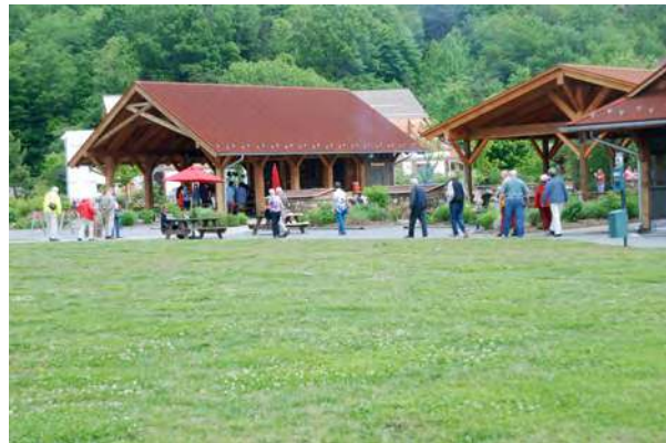
MAC members at Devil's Backbone Brewpub.