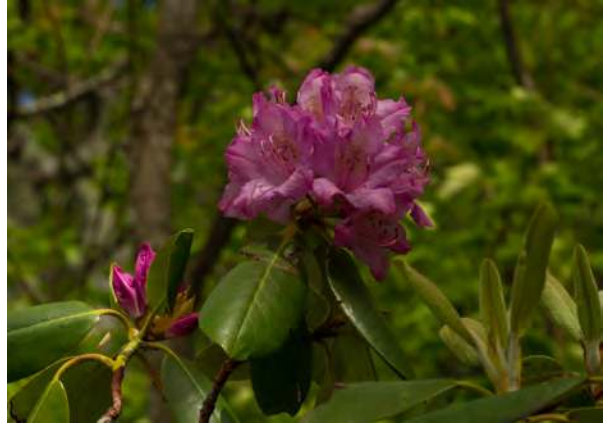
Rhododendron catawbiense at Wintergreen.