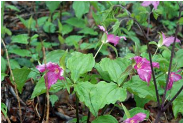
Trillium at the wildflower garden.