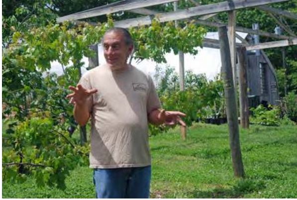
The tour guide at Edible Landscaping Nursery who told us about all kinds of unusual plants they were growing.