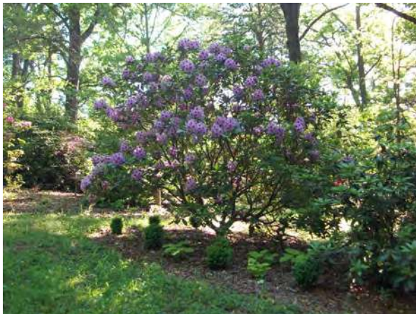
A beautiful rhododendron in the Willis' garden.

showed the most damage this spring? Unfortunately, the answer was quite easy to find—most of our damage was to the Japanese maples. Interesting to me was that both weeping and upright forms showed a range of damage from near zero visible damage to total death of the tree. We did dead tree removal, extensive tree shaping, and light limb removal. The pickup was filled and rounded with dead Japanese maple parts. (Since Mrs. Willis reads this article, I will not note the number of pickup loads that we did.) Under happier news, most of the rhododendrons and azaleas appear to have no severe winter damage. However, some plants only produced two or three blossoms. This was offset by really full bloom in others. The American boxwoods seem to be in good shape. The replacement by Green Mountain boxwoods of the dwarf English box lost to the boxwood blight appears to be working so far.