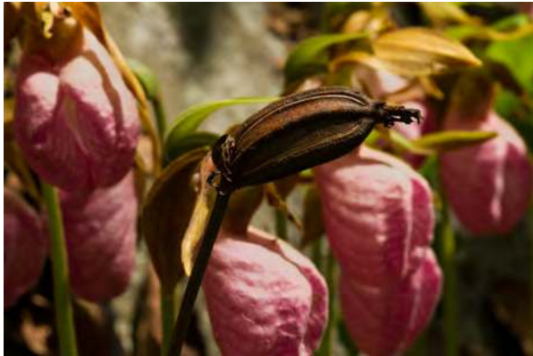
Pink lady slippers with seed pod.