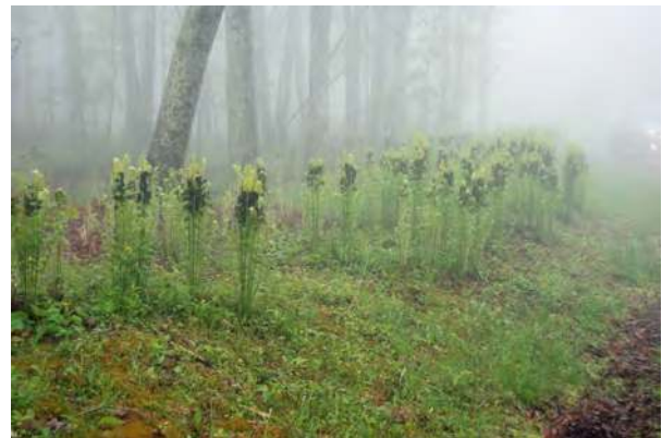
Ancient colony of interrupted fern at Wintergreen.