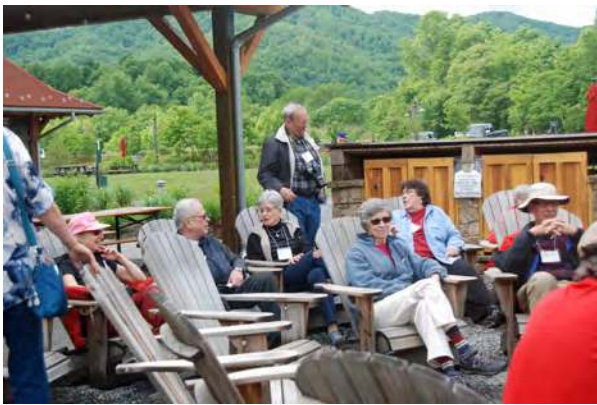
MAC members around the fire pit.