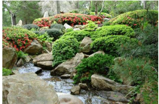
Liesfeld garden.