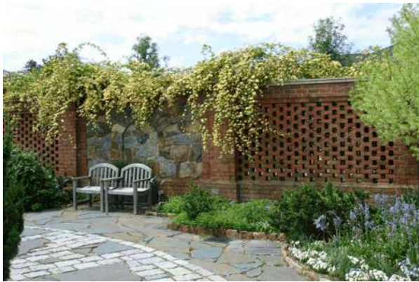
Lewis Ginter Botanical Garden.