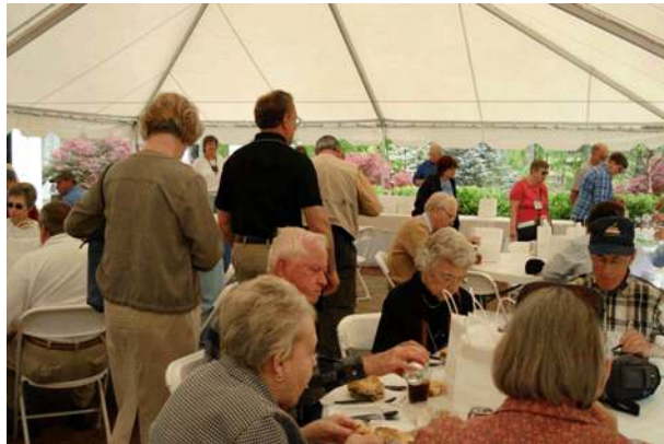
Lunch at Lewis Ginter Botanical Garden.