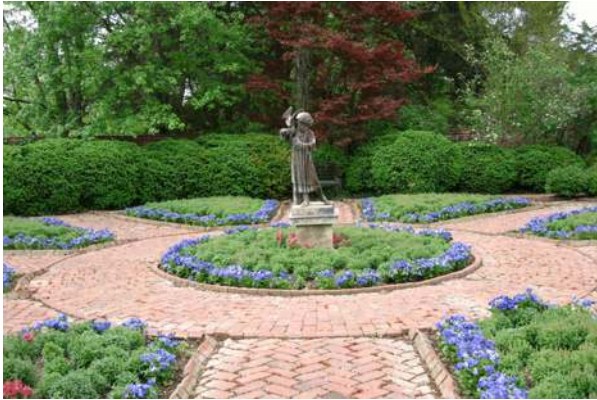
Reed garden.