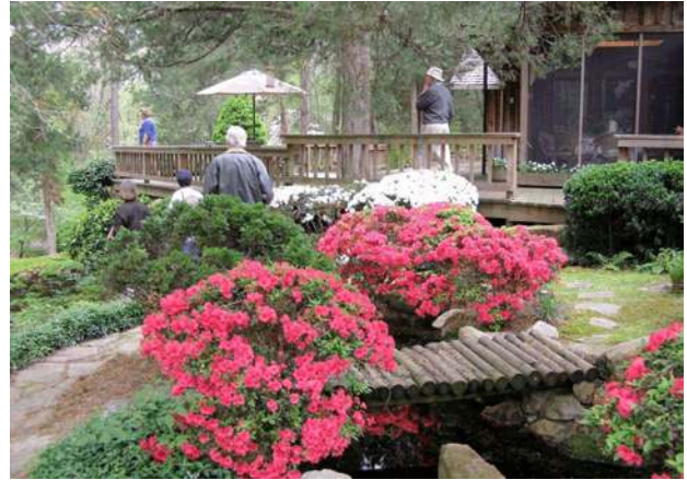
Liesfeld garden.