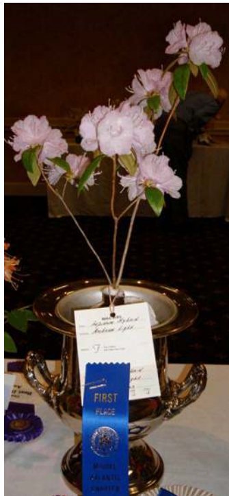
Best in Show 'Ambrose Light' entered by the Fellers.