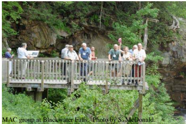
MAC group at Blackwater Falls.

Fortunately the spring has been somewhat wetter than usual at least until June and spring bloom has been as prolonged by several unusually cool spells, a big help to our camellias and daphnes. I hope this report doesn't sound too gloomy. The Lays still enjoy their 30-year-old, 5-acre garden but gardens mature while gardeners simply age.