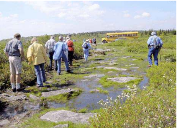
MAC group hiking on Dolly Sods.