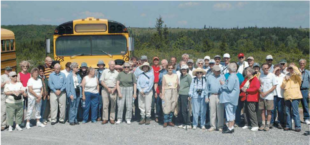
MAC members on field trip to Dolly Sods to see R. prinophyllum .