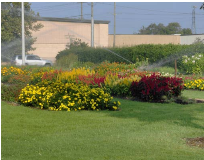
Colorful display at Hampton Roads Agricultural Research and Extension Center.