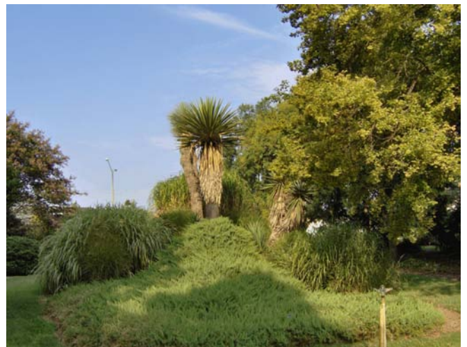
Arboretum at Hampton Roads Agricultural Research and Extension Center.