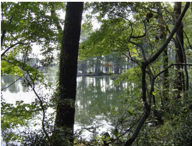
Norfolk Botanical Garden.