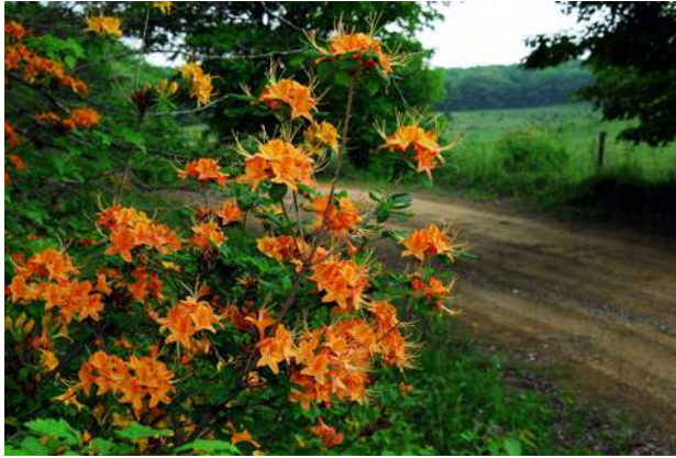
Rhododendron calendulaceum .