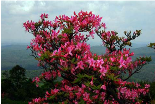
Rhododendron prinophyllum at Spruce Knob.