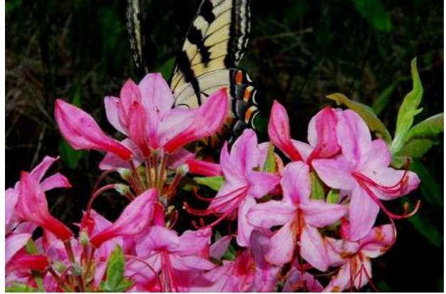
Rhododendron prinophyllum .