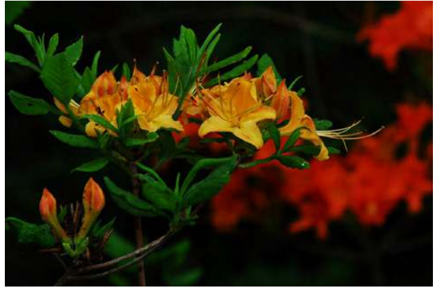
Rhododendron calendulaceum .