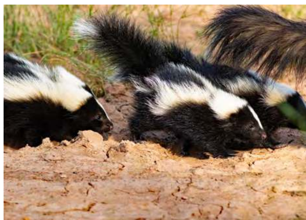
Our visitors.

We had one family visit us one June evening. They did a walk through of the yard and garden from one end to the other. Mom and four young ones. For what ever reason after the visit they left heading over the hill and have never returned. A