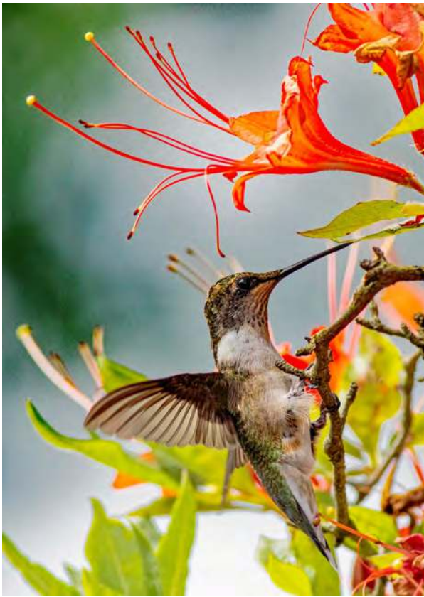
Humming bird on R. prunifolium .