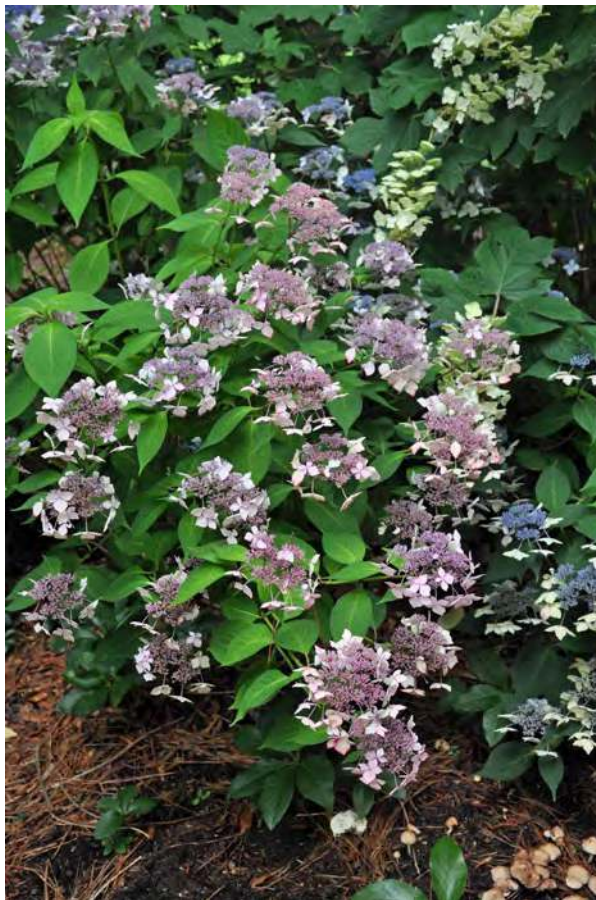
Hydrangea serrata ‘Grayswood’.

*Blooms can be changed from pink to blue by adding aluminum sulfate.