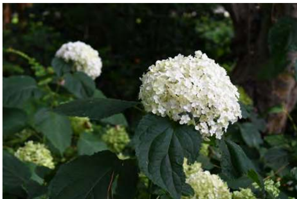
Hydrangea arborescens ‘Annabelle’.