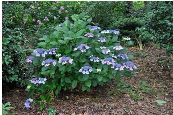
Hydrangea macrophylla ‘Dirr’s Gift’, lacecap type.

If your hydrangea is pink and you want it in blue, you may have to add aluminum sulfate to your soil. Hydrangea macrophylla blooms very well in full shade for me and I have had some cultivars bloom as late as December. Any more plants that I add to my Hydrangea collection are going to be from the newer ones that flower on new growth.