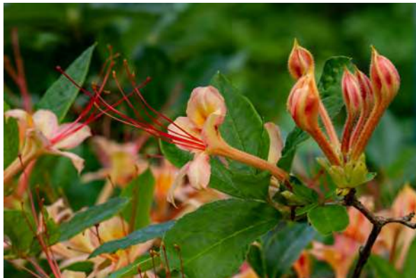
R. prunifolium hybrid.

Wild Petunia ( Ruellia humilis and not in the Petunia family) appeared as a solitary plant three years ago in the bog garden. Its source is a mystery. Since that initial plant, dozens are now fixtures in the garden. Most seedlings are sprinkled in and about the adjacent limestone gravel pathways. They are welcome additions and at home among the azaleas too. Hot days pose no problems for them and they