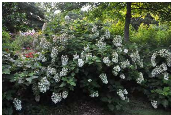
Hydrangea quercifolia ‘Alice’.