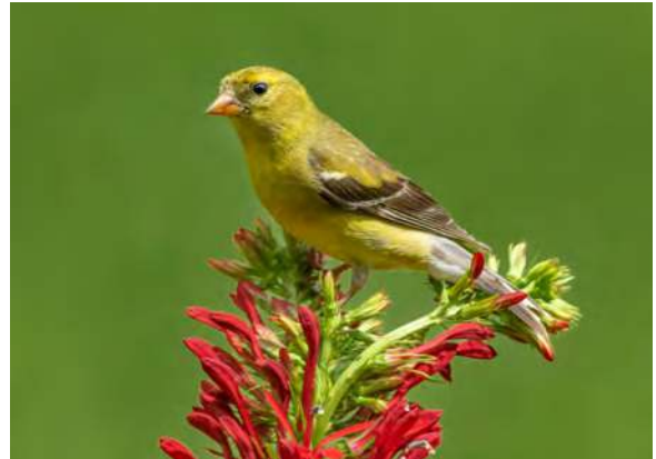
Goldfinch on cardinal flower.