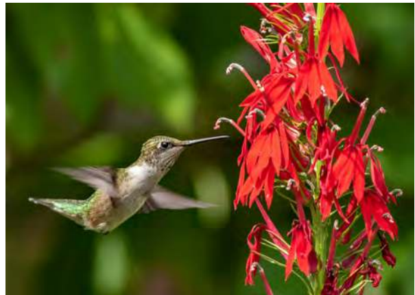
Hummingbird on Lobelia cardinalis.