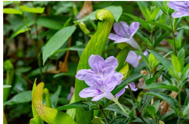
Ruellia humilis.