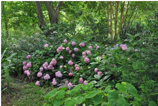
‘Original Endless Summer’ in a wooded garden with ‘Lady in Red’ in background.

If hydrangeas interest you, be sure to read Michael Dirr’s book Hydrangeas for American Gardens