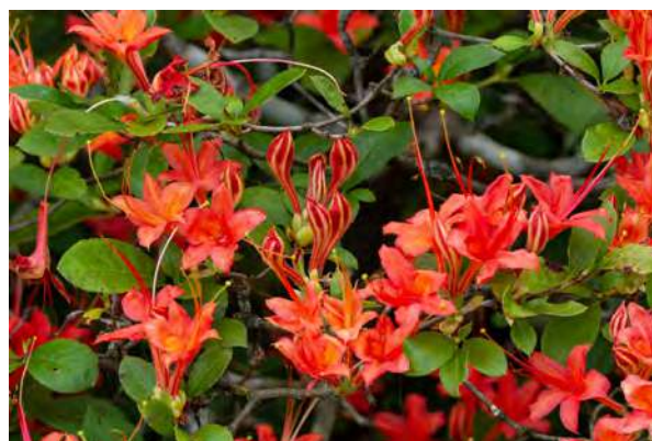
R. prunifolium.