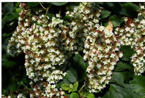
Hydrangea quercifolia ‘Snowflake’.