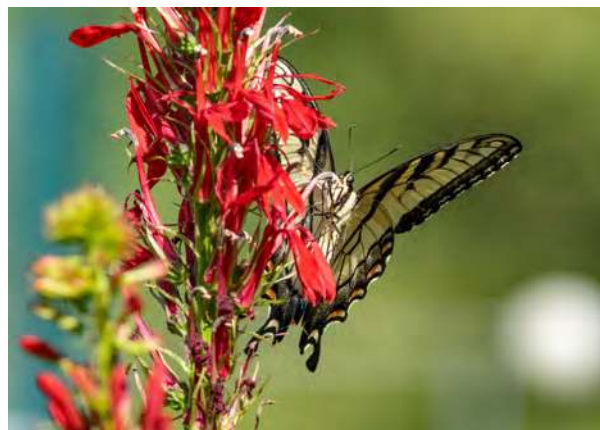
Swallowtail on Lobelia cardinalis .

along many of the roadsides I travel is Sourwood ( Oxydendron arboreum ). When the plumleaf azaleas reach prime anthesis, gaze upward and the Sourwood will be snow white with flowers. For beekeepers, this is a source of the finest honey Appalachia can provide. In the fall, the trees are cloaked in mahogany red foliage and can rival maple trees in color.