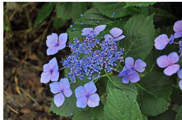
Hydrangea macrophylla ‘Dirr’s Gift’.