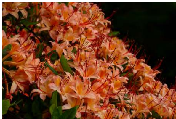
R. calendulaceum x R. arborescens.

family of skunks. Thank goodness the cats were in!