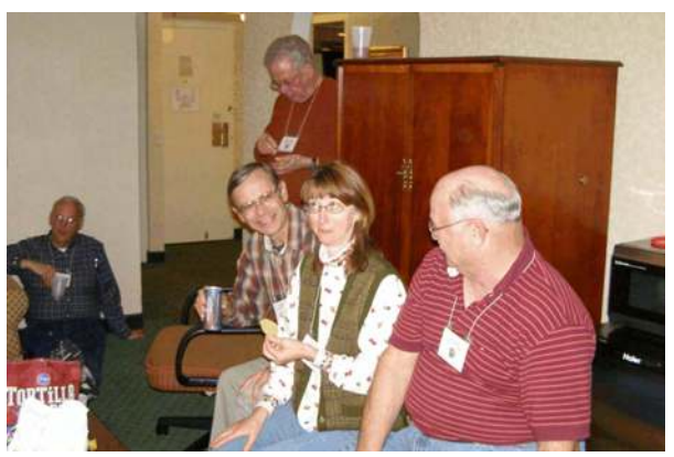
Relaxing after the program in the hospitality room.