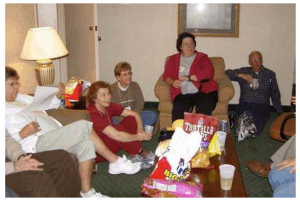
Relaxing after the evening festivities in the hospitality room.