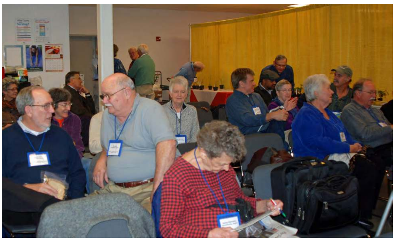
MAC members having a break.