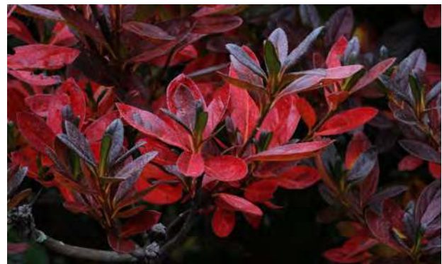
'Girard's Sandra Ann'.

Wintergreen Nature Foundation hosts a wildflower weekend which features talks, walks and demonstrations of all phases of Virginia natural history. The Foundation has a terrific native plant propagation program. Initiated