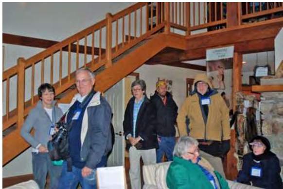
MAC members preparing for hike.