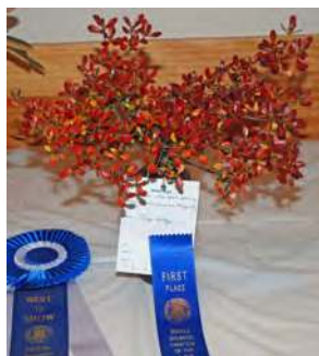
Winner R. kiusianum 'Mangetsu'