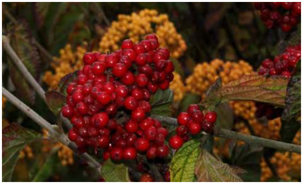
Viburnum 'Cardinal Candy' and 'Michael Dodge'.

Wintergreen Nature Foundation hosts a wildflower weekend which features talks, walks and demonstrations of all phases of Virginia natural history. The Foundation has a terrific native plant propagation program. Initiated