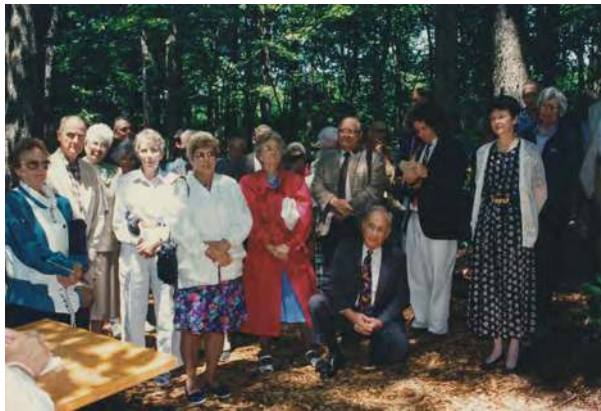
Some MAC members at the May 30, 1996 dedication.