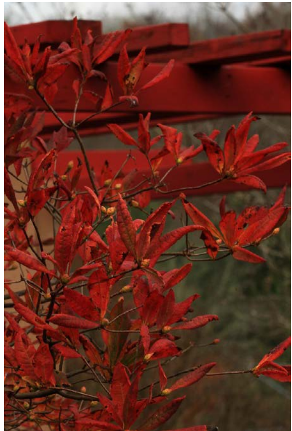
Rhododendron periclymenoides colorful fall foliage.