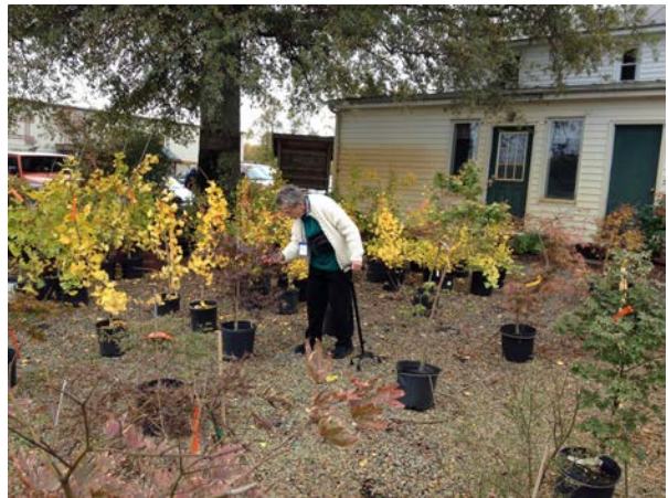
Shirley Gillenwater at Colesville Nursery.