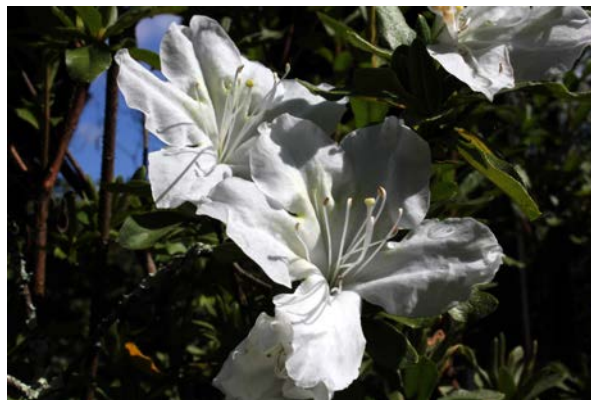
Girard's 'Pleasant White'.

widespread bloom of elepidote and lepidote rhododendrons and evergreen azaleas. 'Mist Maiden' and 'Lee's Dark Purple' have been sporting flowers into November for several weeks. Girard azalea cultivars including 'Sandra Ann' and 'Pleasant White' have been blooming for several weeks as