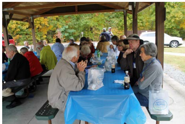
MAC members at picnic lunch.