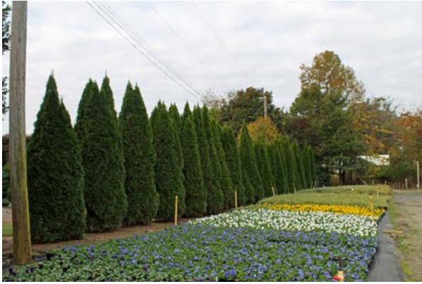
Pansies at Colesville Nursery.