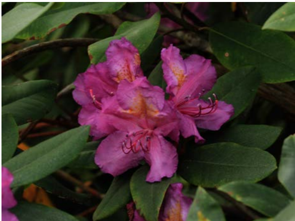
Rhododendron 'Lee's Dark Purple'.