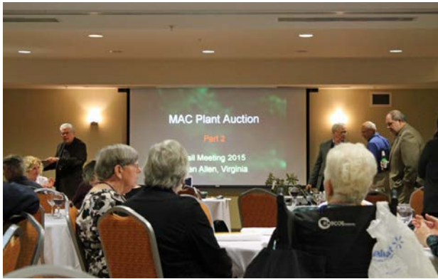
The plant auction.