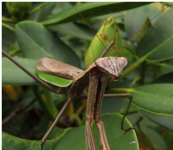
Praying mantis.

Somewhat disconcerting this fall has been a