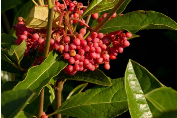
Viburnum nudum 'Brandywine'.