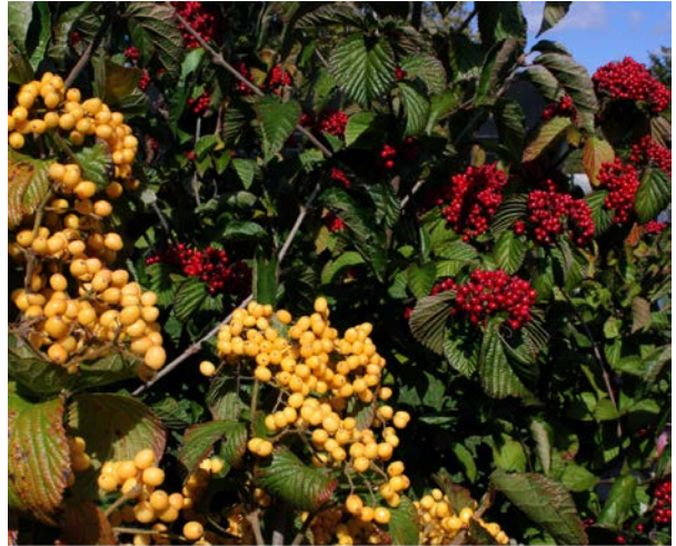
'Michael Dodge' and 'Cardinal Candy' viburnums.