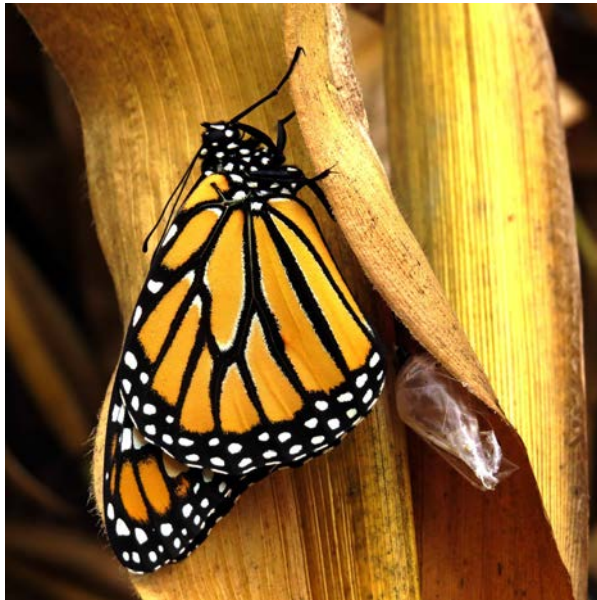
Monarch butterfly and chrysalis.

Hellebore and snowdrop season is less than three months away !