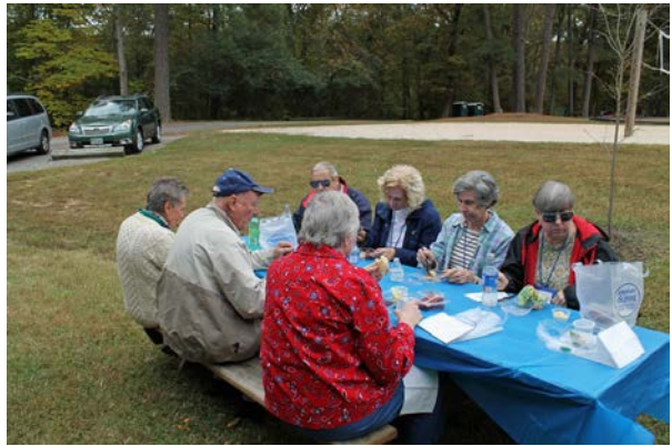
MAC members at picnic lunch.