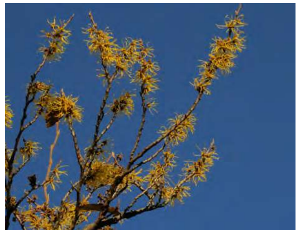
Witch Hazel.

Rhododendrons and azaleas both are heavily budded and waiting on spring. Seed has largely been sparse both here and in some native populations that I have visited. American holly and deciduous holly are heavily laden with berry crops. In May, a male deciduous holly, 'Apollo', was pruned at flowering time. Rather than discard