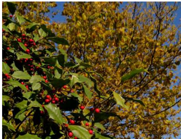
American Holly and Witch Hazel.

Sparkleberries. The resulting berry set was outstanding.