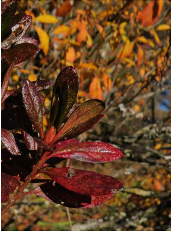
'Girard's Rose' and 'Cornell Pink'.

the freshly pruned twigs, I put several branches in a large vase and placed them beside one of our