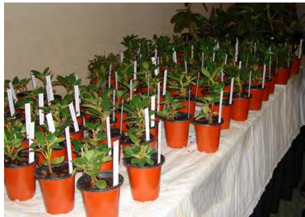
Plant Sale- P4M