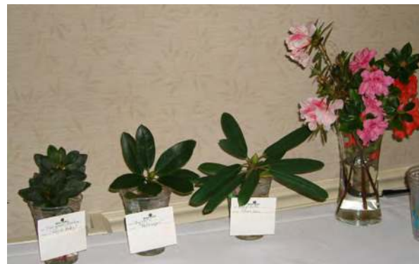
A few foliage show entries