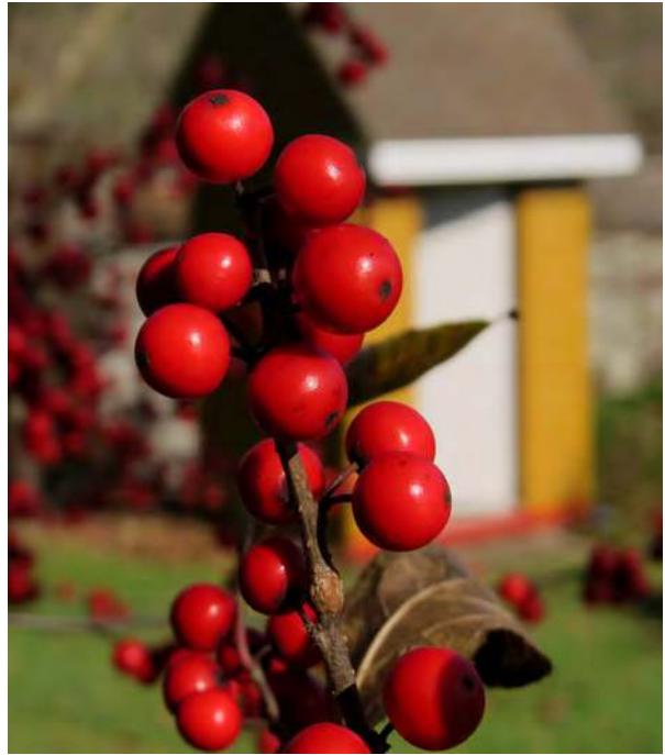
'Sparkleberry' holly.

Sparkleberries. The resulting berry set was outstanding.